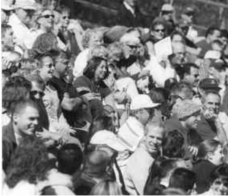
Fall Family Weekend is a wonderful time for parents and students to get together for fun and relaxation.