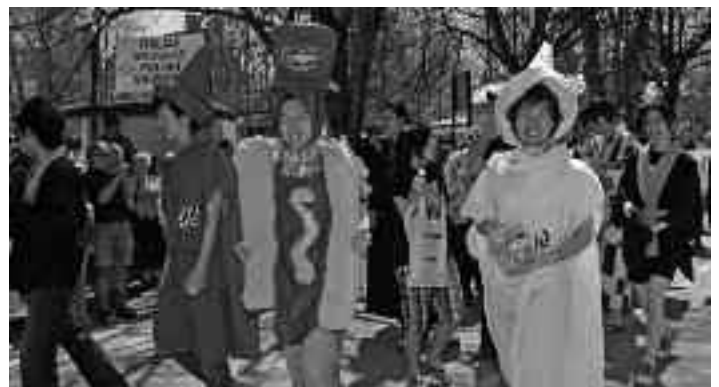
Hot Dog Day is an Alfred community tradition that has occurred every spring for the past three decades.

Are there fraternities or sororities at AU? The AU Board of Trustees voted unanimously in May, 2002 to eliminate fraternities and sororities at Alfred University. As mandated by the trustees, rushing, pledging, perpetuating and initiating activities by fraternities and sororities are strictly prohibited and a serious violation of University policy. Anyone engaging in these activities on or off campus, either as a member, recruiter, or potential member, may be suspended or expelled. Parents are urged to encourage their students not to engage in activities which might be in violation of our social environment policy. (Please note that we do support the national service fraternity Alpha Phi Omega.)