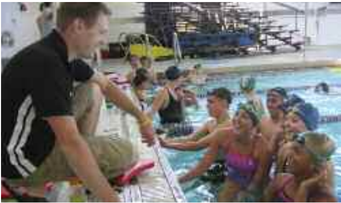
AU Swimming Camp July 8-13 · For swimmers entering grades 7-12 www.alfred.edu/summer/camps/swimming.cfm