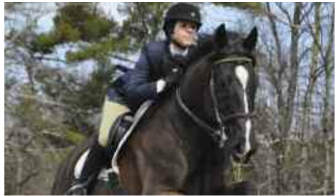
AU Equestrian Camp July 15-21 · For ages 14-17 www.alfred.edu/summer/camps/equestrian.cfm

Visit our website for further information about these and other Alfred University Summer Programs! www.alfred.edu/summer