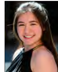
VA E YE