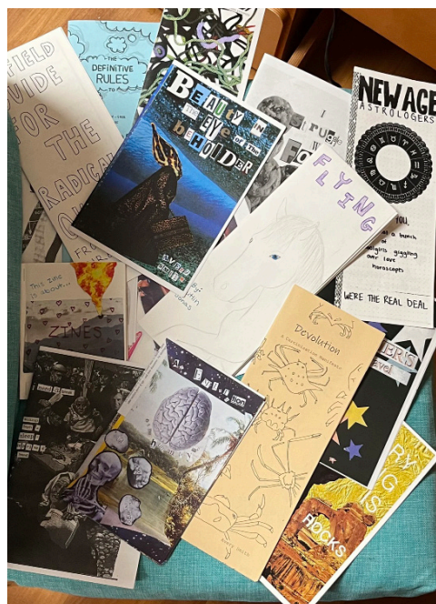
Zines made by students

Zine Machine has taught me so much about the creations of past communities and cultures. I have enjoyed making something creative every week for homework, instead of turning in papers. With all the stresses of college, sometimes I do not use my artistic talent as much as I should. This class really helps me keep creating art, and unique art at that. I recommend this Honors class for anyone who wants to explore their artistic talents in different ways of expression.