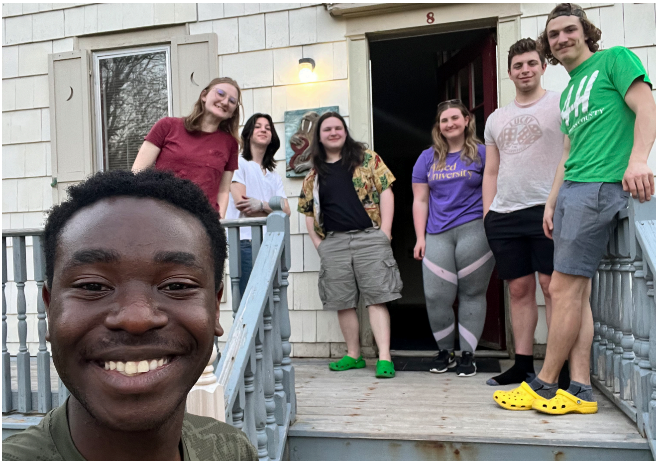
The Servitor group gathers outside of the Honors House for the last meeting of the year

Diving deeper into the history of this University and connecting unusual occurrences that students find within the campus to aliens makes this course so much fun. Who knows, maybe the Honors Program was created by aliens!