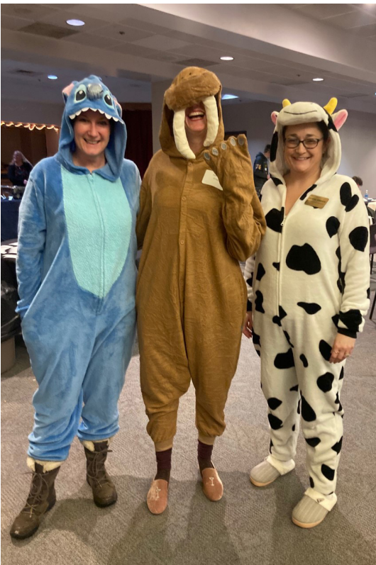
First annual Honors Pancakes and Pajamas party!