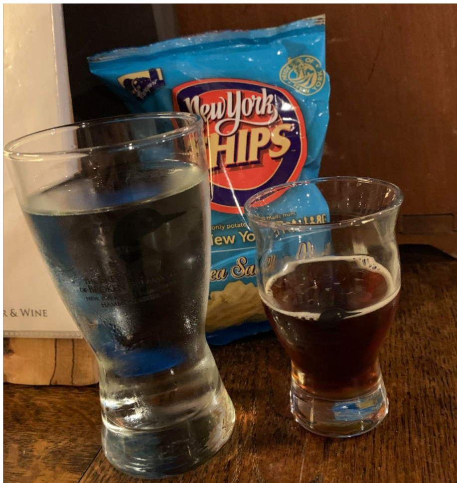
At The Brewery of Broken Dreams, you are given a sample of beer, a glass of water, and chips

Unless you are 21, you are unable to drink what you make; however, once you turn 21, it will be available for you to try. The course ends with a final project of making coasters and/or writing papers on a wine, beer, and liquor of your choosing.