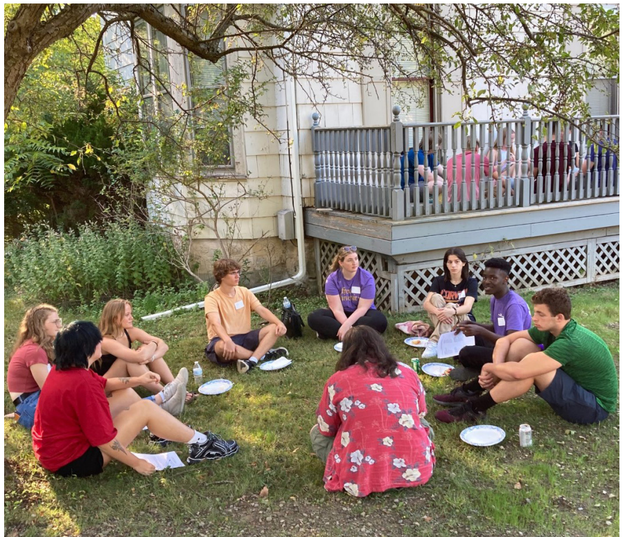
Group discussion during Honors orientation