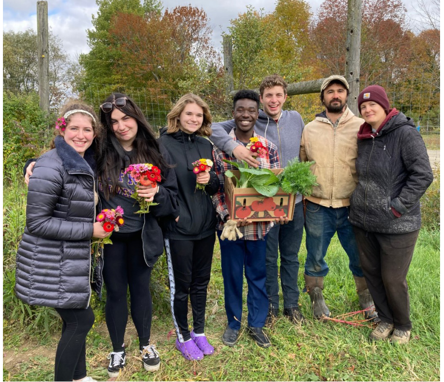
Students volunteering at Living Acres