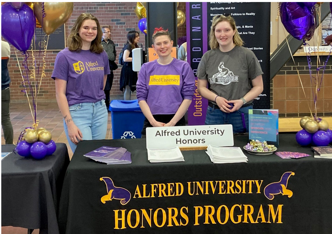
Students representing Honors at an Admissions event

Students discuss a variety of resources related to each week’s inappropriate topic, like childhood, sexism and discrimination, history, and more. All are viewed through a relentlessly anthropological lens, and all involve some serious profanity. We also listened to “WAP.” Discussions are generally passionate and animated, and final presentations can be about any obscene topic that interests students, in any reasonable medium. This riveting seminar is f*cking awesome (see Week Seven for an exploration of censorship).