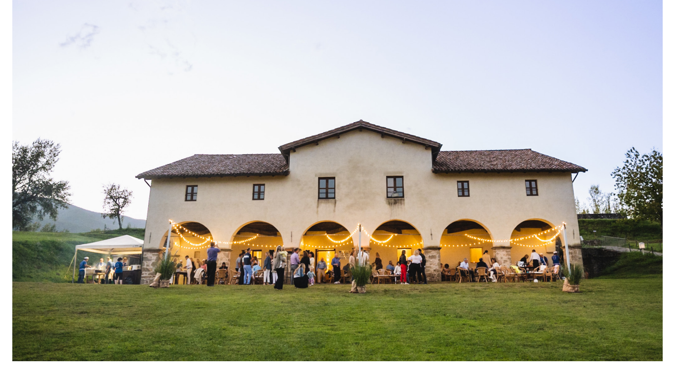
Shaner Hotel Holdings employs nearly 3000 people and operates nearly 70 hotels around the world, including a Tuscan villa in Lucca, Italy which opened this year.

most unmitigated business disaster in the history of the United States," he says. "We went from $400 million in sales to no revenue. When Covid hit, we shut down. And I'm sitting there with 3,000 employees."