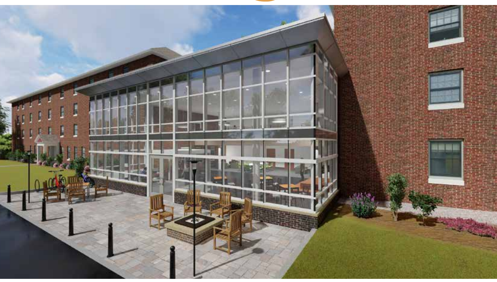
Architect's rendering of the new Moskowitz-Tefft halls project.