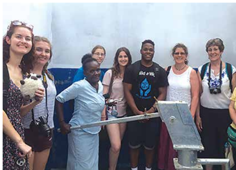
AU students and faculty at the well dedication in Cabare, Haiti.

While in Haiti, the Alfred University students and faculty participated in well drilling operations, observed well management committee meetings, assisted with various operational tasks, and attended the inauguration of the well. The group also studied sustainable development, rural justice, and the profound impact of clean water on daily life. Visits to an orphanage, school, and church provided additional opportunities to learn about the culture of Haiti and to interact with residents.