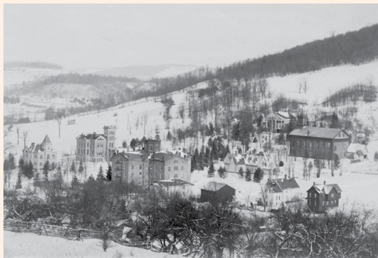
1890s view of campus