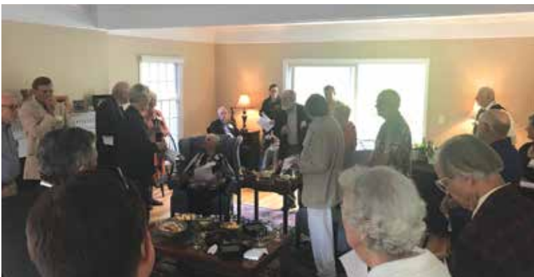
The emeriti faculty reception at the president's house.